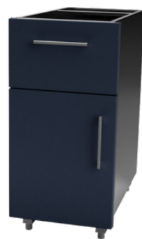
DRAWER & DOOR